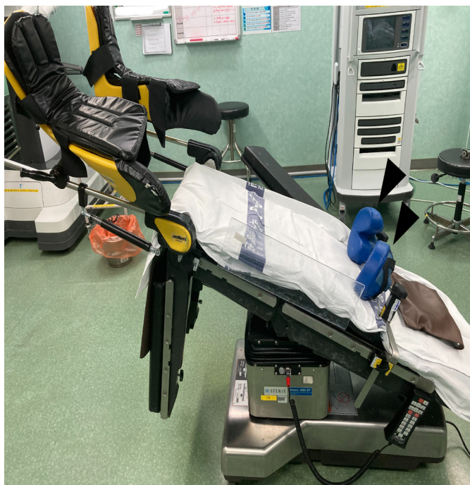
Fig. 2. Lithotomy-Trendelenburg position. Bilateral shoulder supports (black arrowheads) were used so that the patient would not slip from the bed intraoperatively.