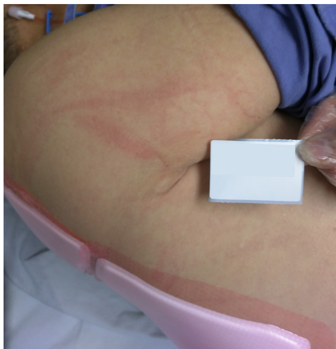
Fig. 4. Reddish linear skin lesions around the shoulder. The image has been altered to obscure any personal identifying information of the patient.